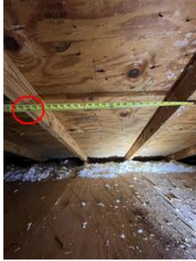
Truss Spacing (24"OC)